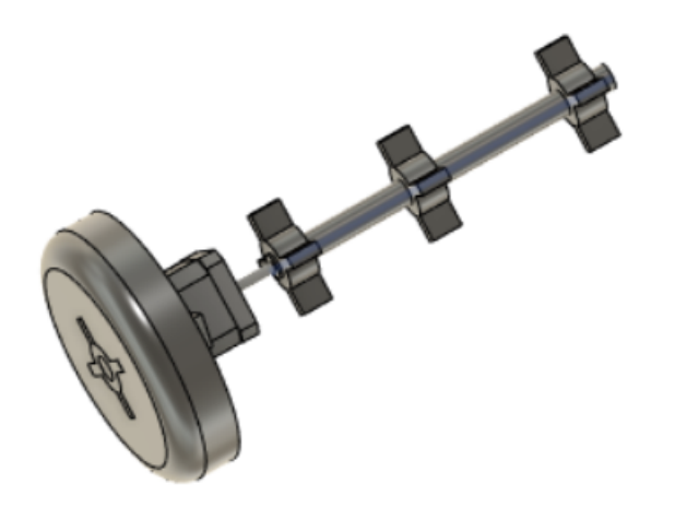
Figure 5 illustrates the stirring mechanism of the bioreactor which is inserted into the inner chamber. The bottom of the mechanism houses an Arduino and sensors, and it is curved to fit into the curved base of the bioreactor.