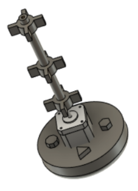
Figure 4 illustrates the unique stirring mechanism of the bioreactor which is inserted into the inner chamber. The central box shape is a stepper motor (Openbuilds 2019) which spins the long rod, which has blades attached. The hexagon, octagon, and triangle, are the pressure sensor, temperature sensor, and dissolved oxygen sensor, respectively.

Figure 3 shows the inner chamber of the bioreactor where the reactions will take place. The previously mentioned nitrogen and oxygen pump holes feed directly into this chamber.