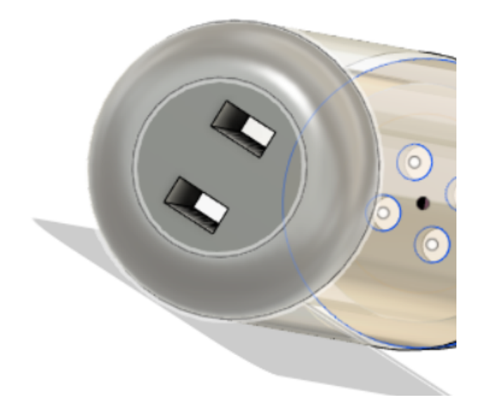
Figure 2 illustrates in greater detail the two holes where nitrogen and oxygen pumps will be inserted to regulate conditions inside the bioreactor.