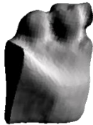
Figure 4: 3D scanning of a jawstump.