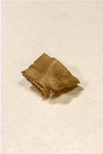
Figure 2: This is the jawstump made of PHB.