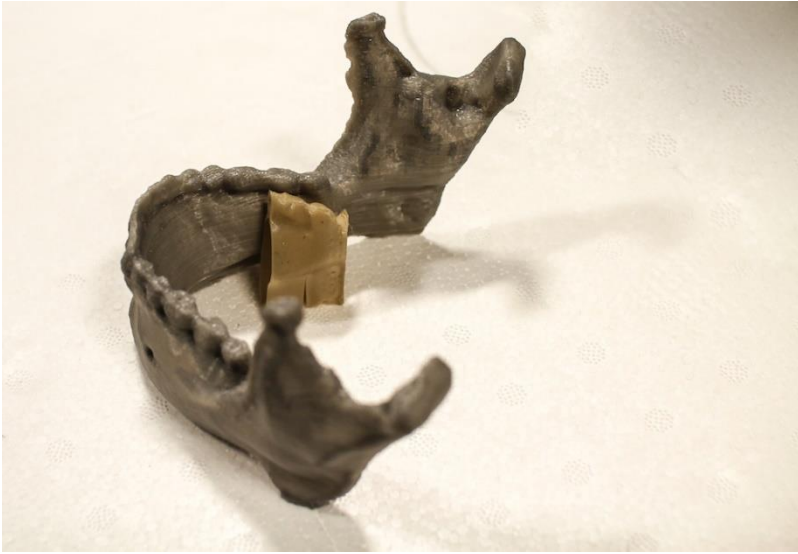
Figure 1: This is a Jaw printed in PLA and a jawstump made of PHB