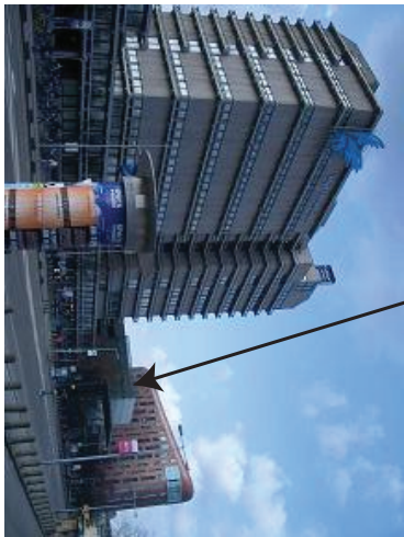
iGEM Jamboree: Entrance Main Building De Boelelaan 1105